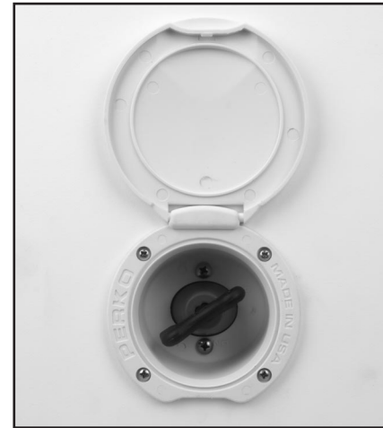
Shown Installed in Cup