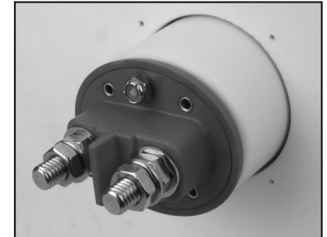
Shown from Back Installed